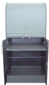
Cabinet in graphite

Special designs are available on request