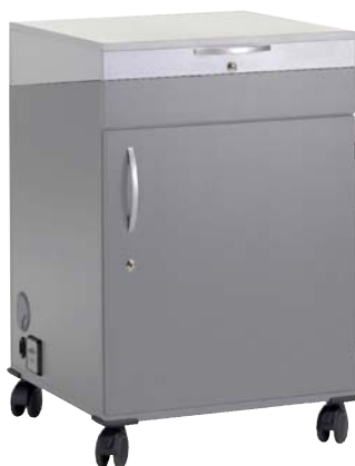
MediaSprint SD with optional box lid