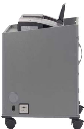
The inclined design allows use with projectors that have a flat viewing angle

Special equipment and solutions are available upon request