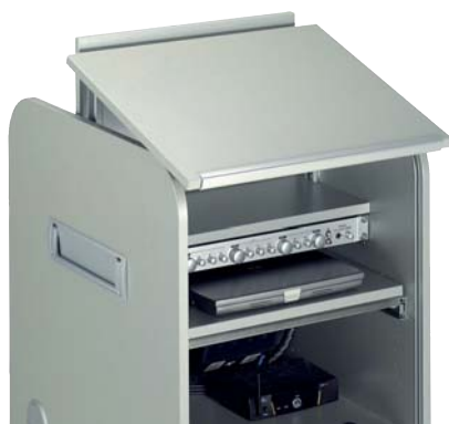
MediaSprint L with lectern attachment without microphone system (Version 1)

Same as Code No. 18925 but modified for the version with lectern ● The simple tilt function enables ergonomic work ● Refer to the sketch for dimensions Code No. 18934