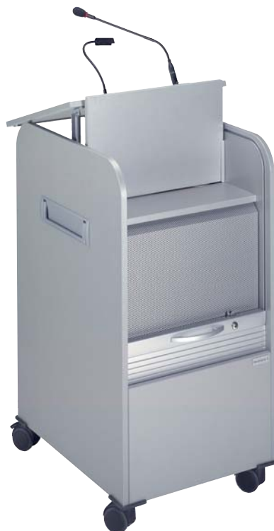
Audience view (Version 2)