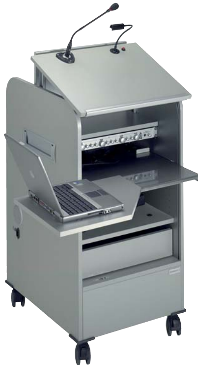
MediaSprint L: lectern design (Version 2)

Lectern attachment in light-grey Code No. 18935-GREY