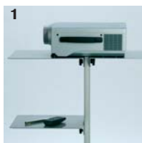
2 steel panels positioned at the same height form a working area with a total size W/D: 32 x 70 cm!