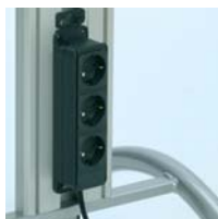
Integrated multiple-outlet socket strip