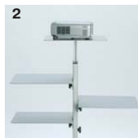
The telescopic extension increases the height of the media trolley by 45 cm.